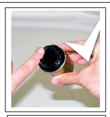
Lubricate contact face.