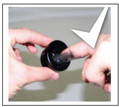
Lubricate internal bore.