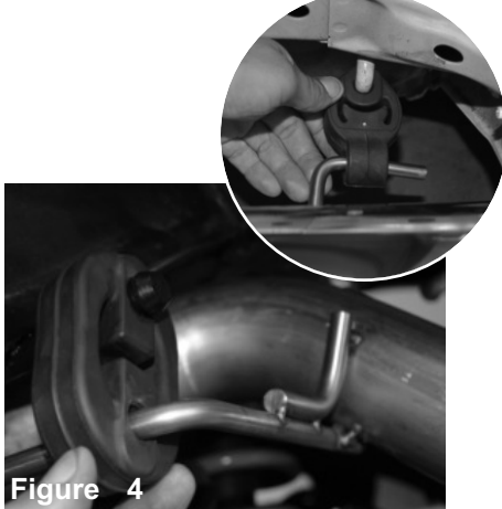
Install and secure the hangars. Secure and tighten using factory springs/bolts. Secure using provided M8 nuts. Tighten and secure the exhaust. Your installtion is now complete. Check for clearance and positon for best possible fit. Thank you for choosing Injen Technology!