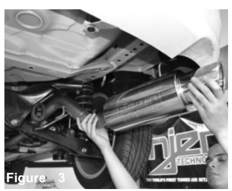
Install the Injen axle back exhaust, and position to the factory flange.