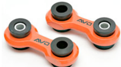
70mm PN# S2X92G1HU070J

You are now the proud owner of a highly tested and proven AVOTurboworld upgrade kit. While you have made a wise choice in selecting this upgrade kit, below we have some suggestions and procedures for you to follow in ensuring its successful installation.