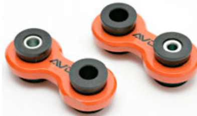
50mm PN# S2X03G1GU050J

Applied Models: 2002-2009 Impreza 2005-2009 Legacy 2004-2009 Forester