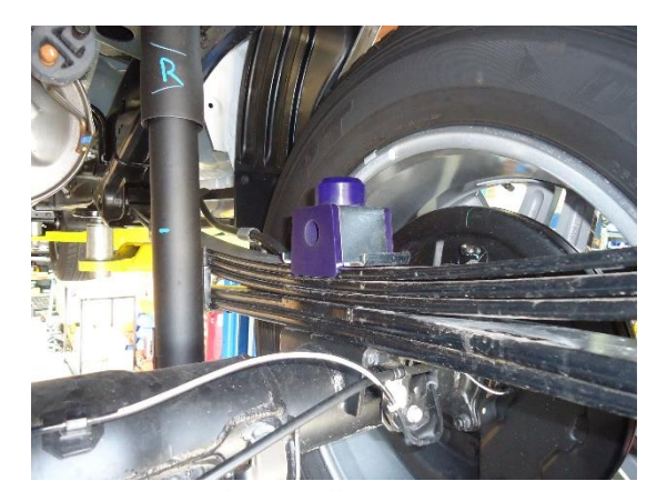
Figure 2 - Sway bar installation.