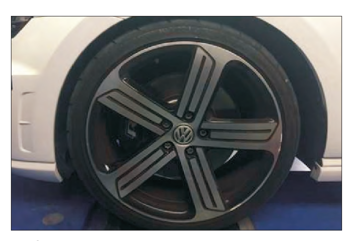
Page 2 of 2

Vehicles lowered extensively and/or have been fitted with after-market wheels - check for any clearance concerns with inner guard.