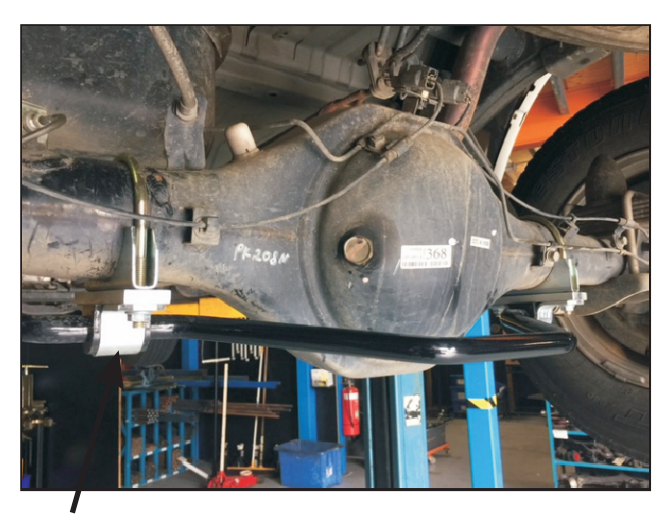
Axle mounting components - U bolts Axle brackets Flat plates D Saddle Flange nuts

Place 3mm spacer over Leaf Eye bolt before adding plate