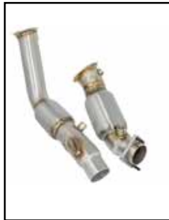
Twisted Steel Downpipes

P/N: 48-36312-1 (Street) 48-36313 (Race)