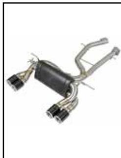
Axle-Back Exhaust System

P/N: 49-36338-C (C/F Tips) 49-36338-P (Pol Tips)