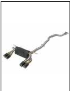
DP-Back Exhaust System

P/N: 49-36337-C (C/F Tips) 49-36337-P (Pol Tips)