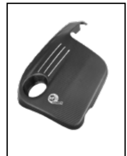
Dry C/F Engine Cover